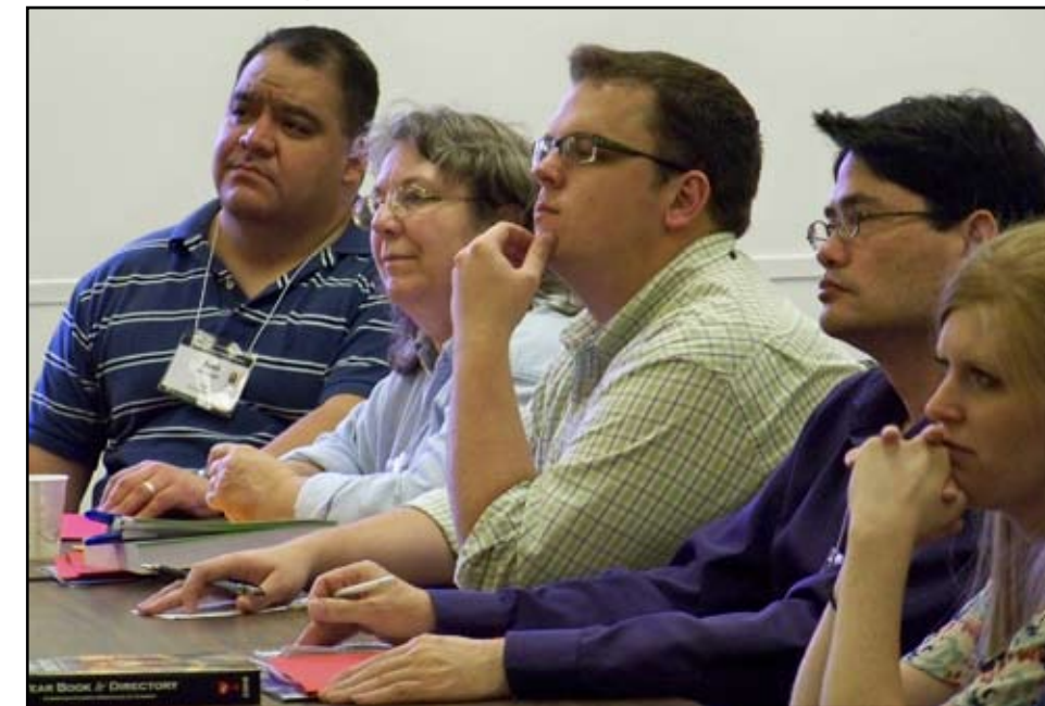
Seminarians the "Beginning a Pastoral Ministry" class

"The Seminarians Conference was an incredible opportunity to meet both current and potential leaders in the