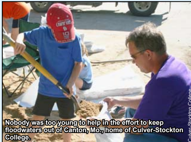
Nobody was too young to help in the effort to keep floodwaters out of Canton, Mo., home of Culver-Stockton College.