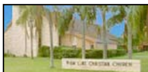
Palm Lake Christian Church, St. Petersburg, Fla.

(Disciples of Christ) in St. Petersburg, Fla., recently completed a donation to HELM that will support a new Fellow. A bequest