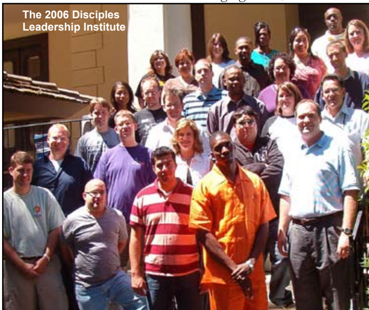
The 2006 Disciples Leadership Institute