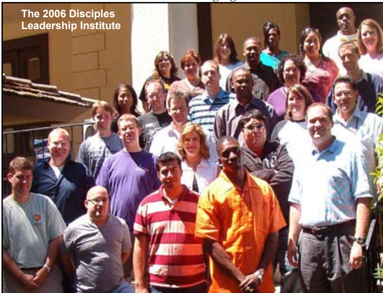
The 2006 Disciples Leadership Institute